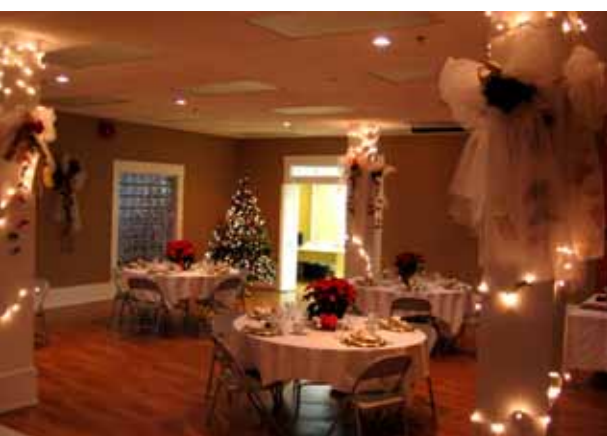
Main Studio (can be decorated for any occasion)

SITE offers more than 7,000 square feet of beautiful rental space. Individual rooms are available for rent and the entire facility can be booked depending on availability.